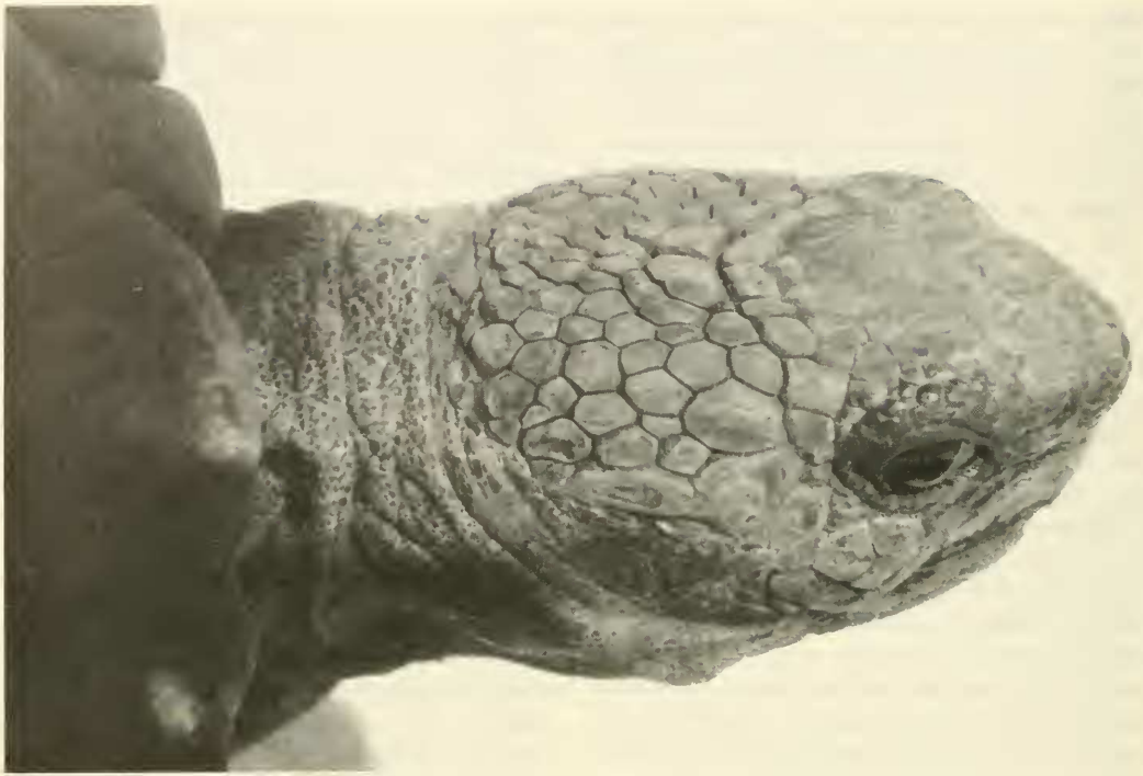
Fig. 2. Dorsolateral view of the head of BYU 39707, showing the small, smooth frontal and prefrontal scales and the abrupt transition to the thickened, raised parietal and temporal scales.

X. lepidocephalus reflect primitive or derived conditions within the genus.